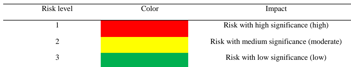
Table 5 Classification of risk/opportunity (expert views)